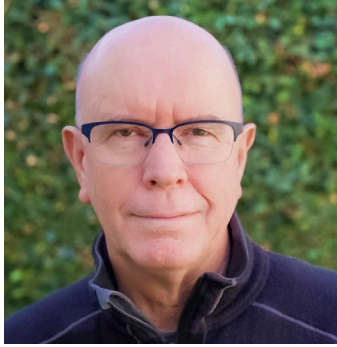
A dose of hope