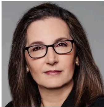
Legal perspective with a dose of hope

Published for free on The Contrarian Substack and initiated by Joyce Vance , this is a project that uses the expertise of lawyers and political scientists to track developments in Trump 2.0., based on facts and transparent analysis. At heart, it's a proposal for civics education. It is a tracker for understanding what is happening and why it's important. The goal is to help people stay informed without being distracted by "bright shiny objects" and/or the chaos, while avoiding the overload that all too often led to disengagement during Trump's first administration.