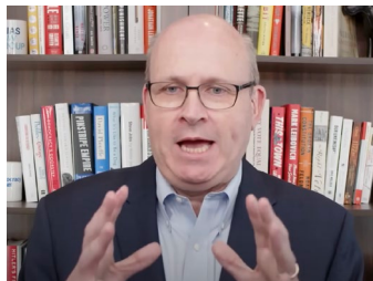
Legal and Political Tracking and Analysis