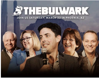
Political News and Commentary