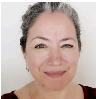
Advocacy; Democrat's messaging

This Substack offers a weekday newsletter telling you how you can make a difference by taking 5-7 minutes of EASY actions. You'll receive an additional Sunday newsletter bursting with hopeful news, Democratic accomplishments, and all the "blue wins" she can find. It'll make you feel better.