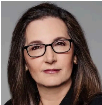
Legal perspective with a dose of hope

Published for free on The Contrarian Substack and initiated by Joyce Vance , this is a project that uses the expertise of lawyers and political scientists to track developments in Trump 2.0., based on facts and transparent analysis. At heart, it's a proposal for civics education. It is a tracker for understanding what is happening and why it's important. The goal is to help people stay informed without being distracted by "bright shiny objects" and/or the chaos, while avoiding the overload that all too often led to disengagement during Trump's first administration.