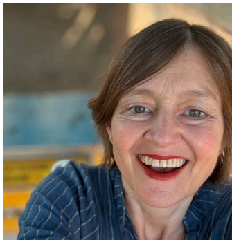
Education, Advocacy and Encouragement