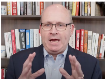
Legal and Political Tracking and Analysis

This Substack , is part civics and part law school. Joyce talks about our government and legal system, how they are supposed to work, and what we can do to keep the Republic. On Sunday nights, she publishes an article titled, The Week Ahead .