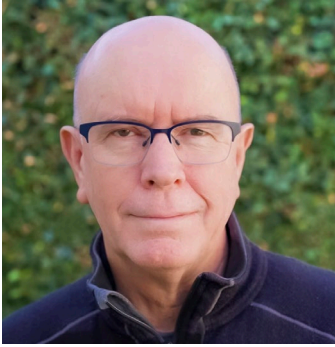
A dose of hope