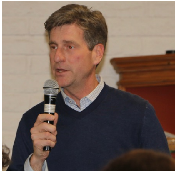
House Rep. Greg Stanton