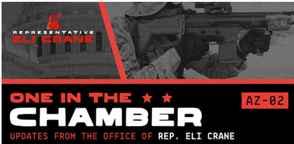
Image above is the letterhead featured in U.S. Rep. Eli Crane's constituent newsletter.

Our new CD2 Congressman Eli Crane (who defeated Tom O'Halleran) has a gun focused newsletter: